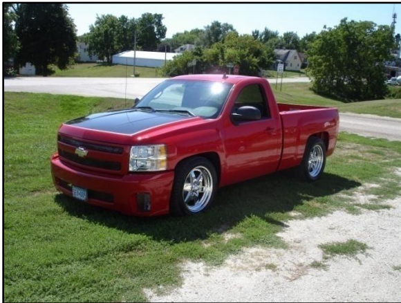
Figure 5 - Custom paint and new wheels

The complete modifications to the exterior give the truck a unique sporty look (See figure 5). This makes for a nice view from the outside, but the driver needs a good view as well.