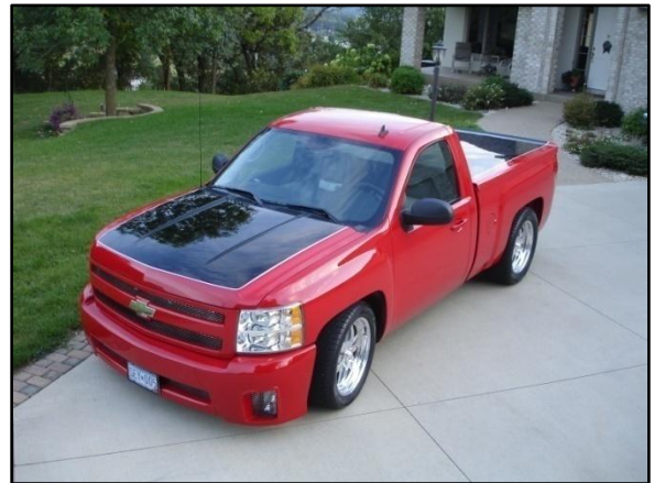
Figure 7 - Finished Chevy Silverado

Jack is very pleased with the work performed by Bremseth Body Shop and the project has ended with a unique Chevy Silverado pickup. Jack ended up with a pickup customized just the way he envisioned (See figure 7 and Table 2).