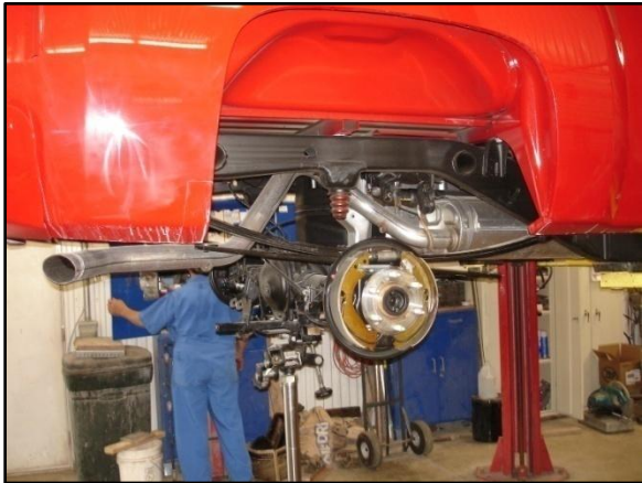
Figure 2 - Rear suspension modifications

To give the Silverado a sporty appearance, Jack with the help of Bremseth Body Shop performed several modifications. To start, he installed a DJM 4/6 lowering suspension which included new upper and lower control arms in the front for a 4 inch drop (See figure 2). He removed the rear axle to the top of the leaf springs and modified it for a total of 7 ¼-inch drop.