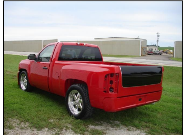
Figure 3 – End gate with re-located handle and new wheels

Jack had several components from Street Scene added to complements the effects of the chassis lowering kit. First, he added a front bumper and rear roll pan as well as the black chrome inserts in the grille. The paintable grille came from Chevrolet while the billet aluminum bow ties are from Empire. Next, hours of work by Bremseth Body Shop went into the relocating of the tailgate handle and the bodywork involved with it (See figure 3). Jack, John, and Cory decided on a paint scheme of Lamborghini Black Pearl and Lenticular Silver on the hood and the Gaylord tonneau cover and tailgate. Lastly, he had the door handles painted to provide a smooth look to the body (See figure 4).