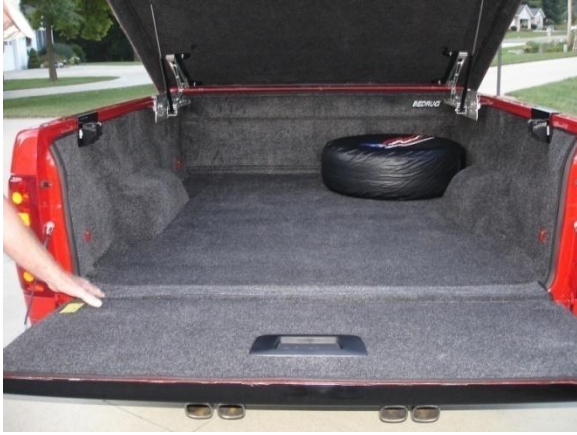
Figure 4 - Box cover and box rug.

The complete modifications to the exterior give the truck a unique sporty look (See figure 5). This makes for a nice view from the outside, but the driver needs a good view as well.